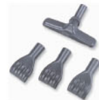
3 adjustable floor nozzles (2, 5, 10mm)