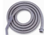
5M/16.4ft Suction hose