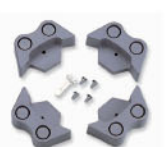
Feet / pipe holder