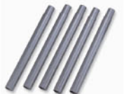
5 Extension tubes