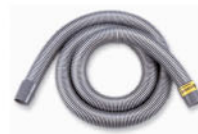
2.5M/8.2ft Discharge hose