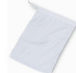
Sludge collection bag